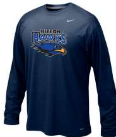
Nike Long Sleeve Dri-Fit