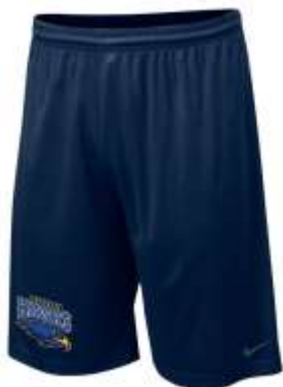
Nike Fly Short