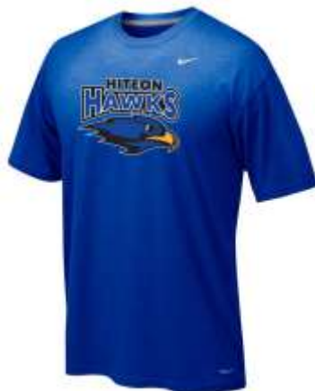
Nike Short Sleeve Dri-Fit