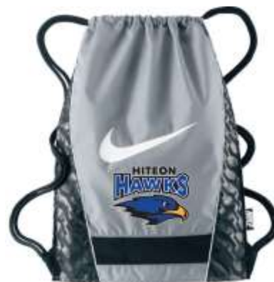
Nike Cinch Bag