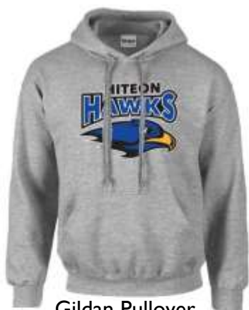
Gildan Pullover Sweatshirt

More items available on website than shown here