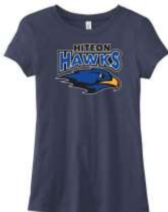
Bella Women's Short Sleeve T-shirt