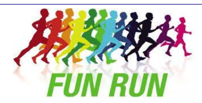
Calling all Hiteon families--SAVE THE DATES!

Please be aware that Hiteon's Lost and Found is cleaned out on the third Thursday of every month. Be sure to take a moment to stop in and look through the Lost and Found (or remind your student to do so) before noon on Thursday, January 18 <sup>th</sup>. ALL unclaimed items will be donated to the Beaverton School District Clothes Closet for district families in need.