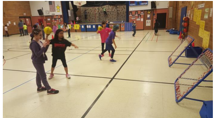
Students trying out our new Tchoukball sets received through a BEF (Beaverton Education Foundation) grant. This has been a great activity to work on throwing, catching and looking at angles involved in sports.

Classes have started working on their striking skills. We will practice striking a variety of objects with our hands, paddles, and racquets. By the end of the month many students will have tried striking balloons, beach balls, volleyballs, foam balls, and shuttlecocks. We have been doing a variety of fitness activities to help us continue to improve our balance, flexibility, muscular strength/endurance and cardiovascular endurance. Some classes have been introduced to the basics of speed stacking. Students are having fun while improving hand-eye coordination, fine motor skills, and bilateral proficiency. Over the last month students have had the opportunity to try out and monitor their activity levels with pedometers in P.E. class.